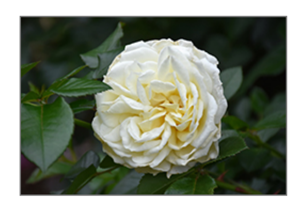
Polar Express Sunbelt Rose flowers

Exciting clusters of lovely snow white blooms, with creamy centers that really stand out; blooms constantly throughout the season and will make a stunning visual impact along walkways, borders, or in the garden; disease resistant