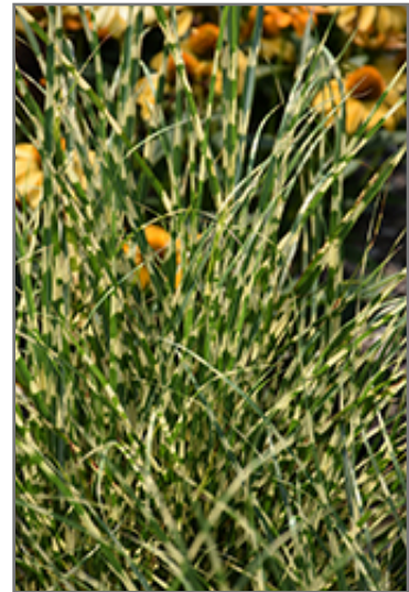
Bandwidth Maiden Grass foliage

Bandwidth Maiden Grass is recommended for the following landscape applications;