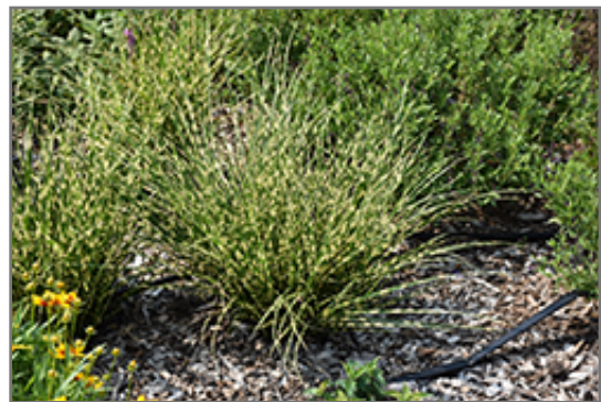
Bandwidth Maiden Grass