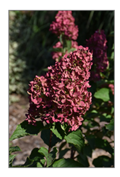
Berry White Hydrangea flowers (faded)