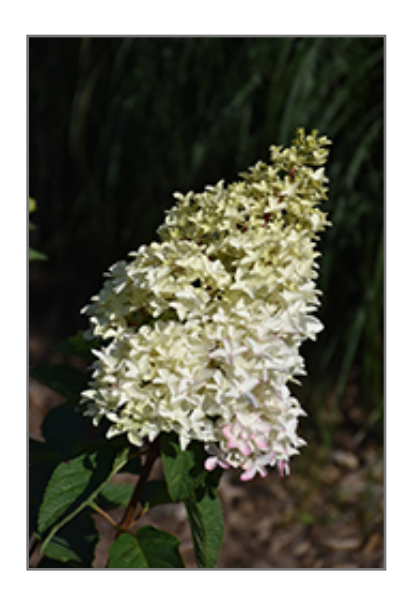
Berry White Hydrangea flowers