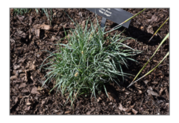
Blue Zinger Blue Sedge

Blue Zinger Blue Sedge is a dense herbaceous evergreen perennial grass with a mounded form. It brings an extremely fine and delicate texture to the garden composition and should be used to full effect.