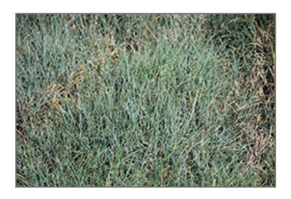
Blue Zinger Blue Sedge foliage

This is a relatively low maintenance plant, and is best cleaned up in early spring before it resumes active growth for the season. It has no significant negative characteristics.