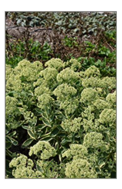
Frosted Fire Stonecrop flowers

A highly desirable groundcover, forming a dense mound completely covered in broccoli-like rose pink flowers, which fade to pale pink in early fall; deep green foliage with creamy yellow margins is prominent all season; needs a dry and sunny location