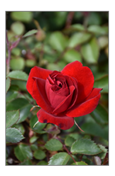
Canadian Shield Rose flowers