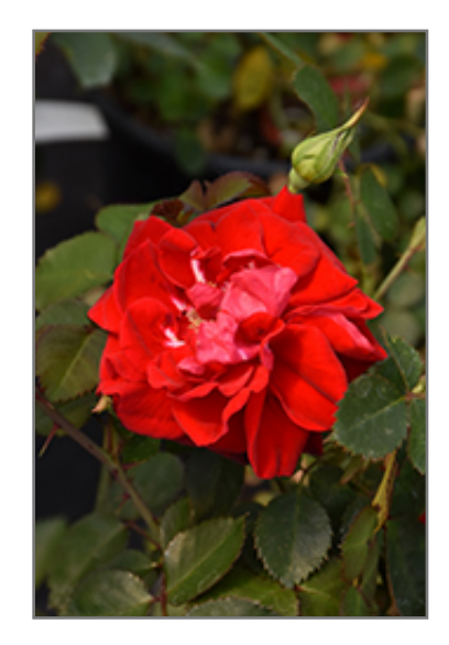
Canadian Shield Rose flowers