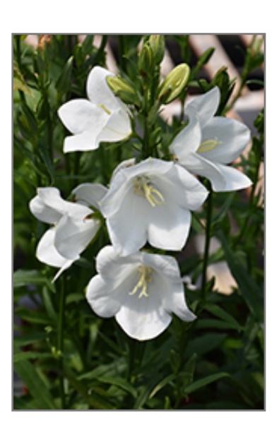
Takion White Peachleaf Bellflower flowers

Takion White Peachleaf Bellflower is smothered in stunning white bell-shaped flowers at the ends of the stems from early to late summer, which emerge from distinctive buttery yellow flower buds. Its narrow leaves remain emerald green in colour throughout the season.