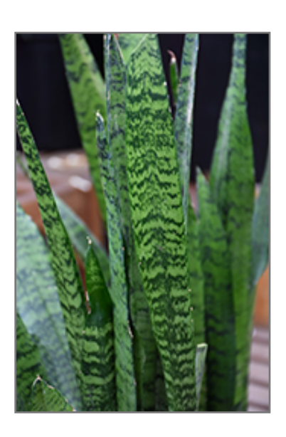
Snake Plant foliage

This plant is native to the tropics and prefers growing in moist environments with evenly warm conditions all year round. In our climate, it is usually grown as an outdoor annual in the garden or in a container. If you want it to survive the winter, it can be brought in to the house and provided with special care, and then returned to the garden the following season. In its preferred tropical habitat, it can grow to be around 4 feet tall at maturity, with a spread of 18 inches. However, when grown as an annual or when overwintered indoors, it can be expected to perform differently, and its exact height and spread will depend on many factors; you may wish to consult with our experts as to how it might perform in your specific application and growing conditions.