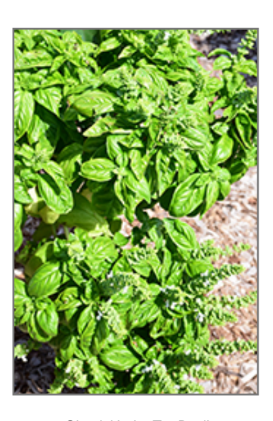
SimplyHerbs Try Basil

A culinary variety that produces large leaves with a rich, sweet flavor, on an upright bushy plant; will produce white flowers in summer; pinch flower stems to promote leaf growth; great for mixed containers, herb gardens, and annual beds