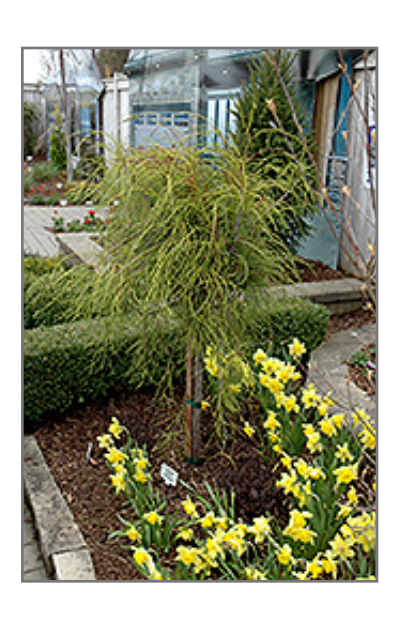
Threadleaf Arborvitae

Threadleaf Arborvitae will grow to be about 8 feet tall at maturity, with a spread of 4 feet. It tends to be a little leggy, with a typical clearance of 4 feet from the ground, and is suitable for planting under power lines. It grows at a slow rate, and under ideal conditions can be expected to live for 50 years or more.