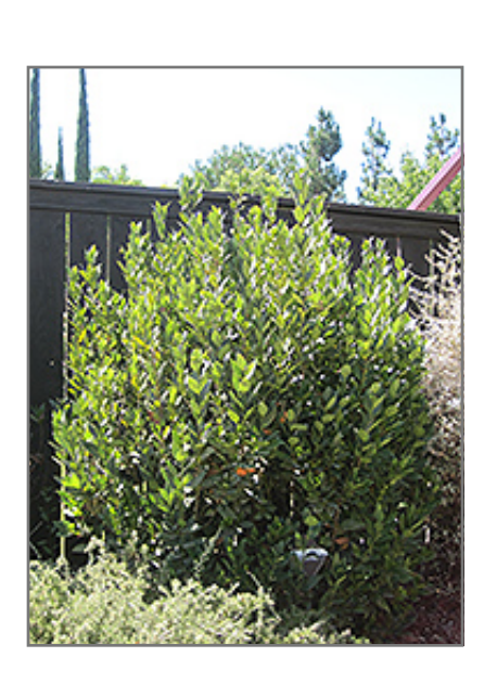
Sweet Bay (shrub form)

When grown indoors, Sweet Bay (shrub form) can be expected to grow to be about 6 feet tall at maturity, with a spread of 4 feet. It grows at a medium rate, and under ideal conditions can be expected to live for approximately 60 years. This houseplant will do well in a location that gets either direct or indirect sunlight, although it will usually require a more brightly-lit environment than what artificial indoor lighting alone can provide. It does best in average to evenly moist soil, but will not tolerate standing water. The surface of the soil shouldn't be allowed to dry out completely, and so you should expect to water this plant once and possibly even twice each week. Be aware that your particular watering schedule may vary depending on its location in the room, the pot size, plant size and other conditions; if in doubt, ask one of our experts in the store for advice. It is not particular as to soil type or pH; an average potting soil should work just fine.