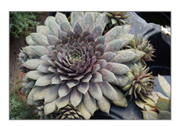
Twilight Blues Hens And Chicks

This variety is very hardy and drought tolerant; this variety features olive green leaves with dark burgundy-purple tips; ideal for rock gardens and containers