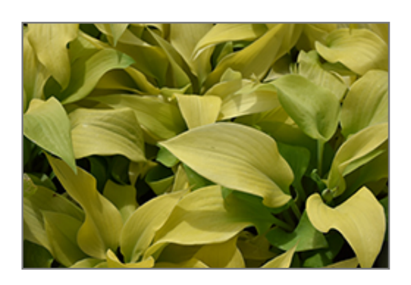
Prairie Moon Hosta foliage