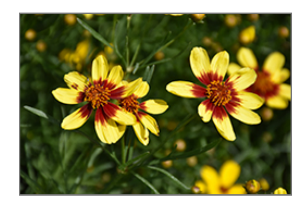
Bengal Tiger Tickseed flowers

A gorgeous variety, covered with striking, daisy-like yellow flowers with deep red centers and gold eyes; tolerant of pests and drier soils; thriving in sandy and rocky soils; great as edging, or in containers; mildew resistant foliage