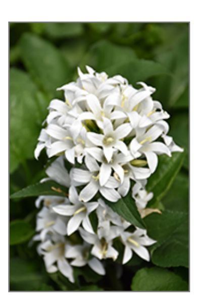
Genti White Clustered Bellflower flowers

Genti White Clustered Bellflower features showy clusters of white bell-shaped flowers at the ends of the stems from late spring to early summer. The flowers are excellent for cutting. Its tomentose pointy leaves remain dark green in colour throughout the season.