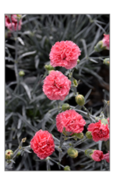
Scent First Pink Fizz Pinks flowers

This beautiful fragrant variety has an intense, spicy aroma; fully-double, frilly flowers of bubblegum pink rise above gray-green foliage; great for borders, annual beds, and containers