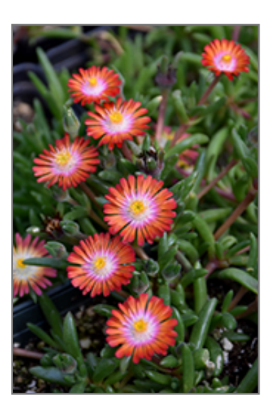
Jewel Of Desert Grenade Ice Plant flowers

A low growing carpet-like, succulent, native to South Africa but amazingly hardy in North America; dazzling orange-scarlet daisy-like flowers with hot pink rings and yellow centers; perfect for xeriscapes, rock gardens, screes and sandy soils