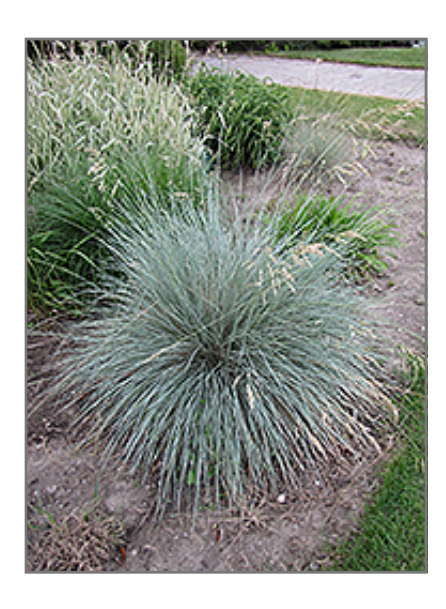
Blue Oat Grass in bloom