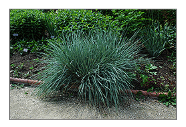
Blue Oat Grass