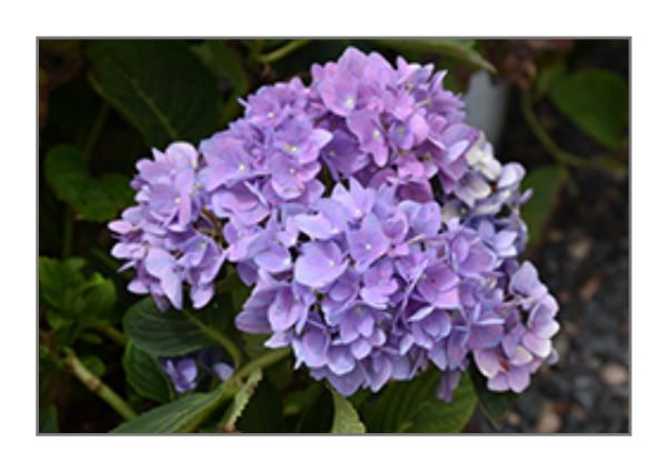
Cityline Rio Hydrangea flowers