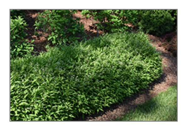
Yuki Snowflake Deutzia

Yuki Snowflake Deutzia is recommended for the following landscape applications;