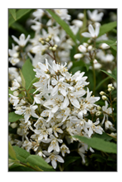
Yuki Snowflake Deutzia flowers

This shrub will require occasional maintenance and upkeep, and should only be pruned after flowering to avoid removing any of the current season's flowers. It has no significant negative characteristics.