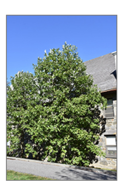
Moonglow Sweetbay Magnolia