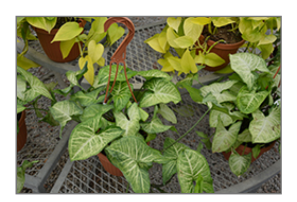
White Butterfly Arrowhead Plant

An easy to care for indoor climbing vine, featuring arrow shaped leaves of cream edged in dark green; pinch stems to keep bushy and avoid climbing; a great tabletop accent, or a showy climber for indoor trellises; thrives well in low or medium light areas