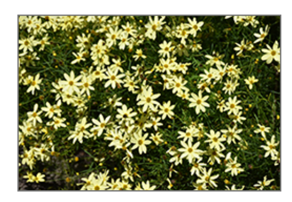
Moonbeam Tickseed flowers

A beautiful compact mounded and drought tolerant variety that features fine, ferny foliage covered in soft buttery yellow flowers; blooms from early to late summer; an excellent addition to beds, borders or containers; thrives in poor, sandy soils