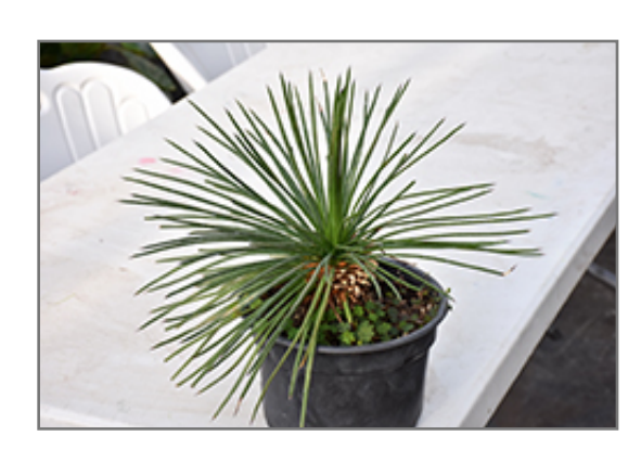
Twin-flowered Agave

This unusual variety has very narrow, dark green leaves that are spineless and flexible, set in a dense rosette; towering spikes with yellow flowers when rosettes mature; a great visual accent for indoor planters in bright locations