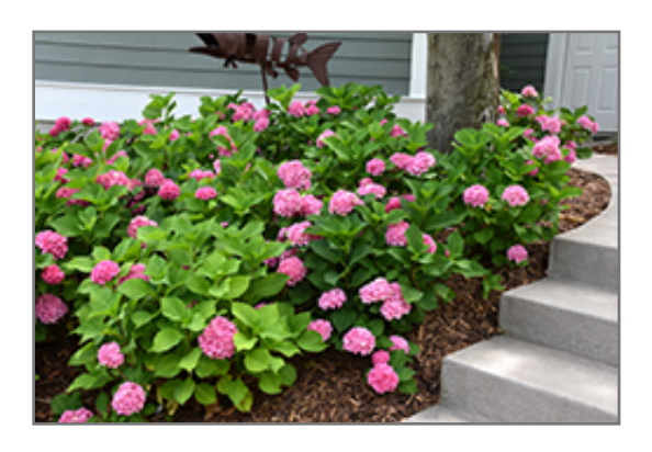
Let's Dance Rhythmic Blue Hydrangea in bloom