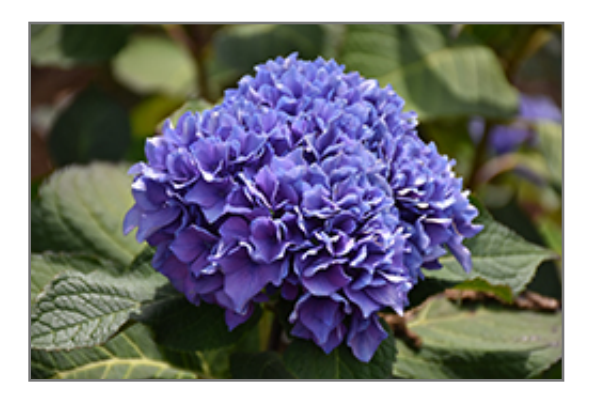
Let's Dance Rhythmic Blue Hydrangea flowers

This is a multi-stemmed houseplant with a more or less rounded form. Its relatively coarse texture stands it apart from other indoor plants with finer foliage. This plant may benefit from an occasional pruning to look its best.