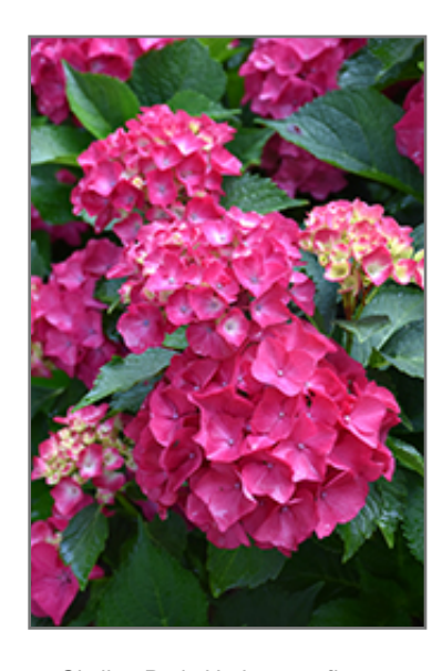
Cityline Paris Hydrangea flowers

This is a multi-stemmed houseplant with a more or less rounded form. Its relatively coarse texture stands it apart from other indoor plants with finer foliage. This plant may benefit from an occasional pruning to look its best.