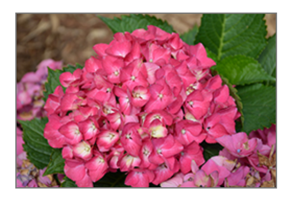
Cityline Paris Hydrangea flowers