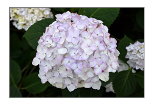
Blushing Bride Hydrangea flowers

This exciting new shrub is the second in Bailey's Endless Summer series, offering large snow-white ball-shaped flowers with semi-double florets which fade to soft pink; blooms over an extended season on both old and new wood; a striking interior accent