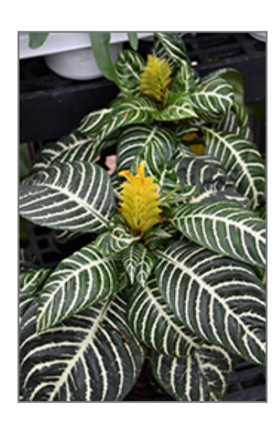
Zebra Plant in bloom

When grown indoors, Zebra Plant can be expected to grow to be about 24 inches tall at maturity extending to 3 feet tall with the flowers, with a spread of 24 inches. It grows at a medium rate, and under ideal conditions can be expected to live for approximately 10 years. This houseplant should only be grown away from direct sunlight or in a room with strong artificial light. It prefers to grow in average to moist soil. The surface of the soil shouldn't be allowed to dry out completely, and so you should expect to water this plant once and possibly even twice each week. Be aware that your particular watering schedule may vary depending on its location in the room, the pot size, plant size and other conditions; if in doubt, ask one of our experts in the store for advice. It is not particular as to soil type or pH; an average potting soil should work just fine.