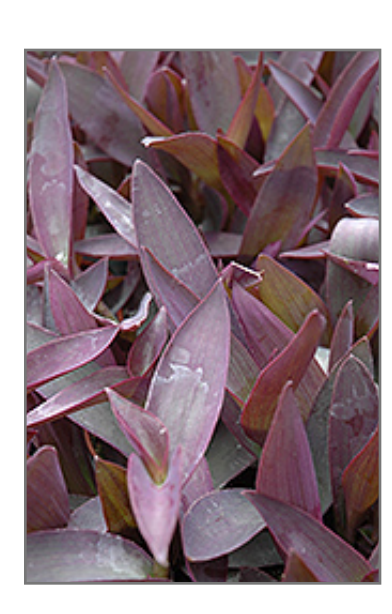
Purple Heart foliage

There are many factors that will affect the ultimate height, spread and overall performance of a plant when grown indoors; among them, the size of the pot it's growing in, the amount of light it receives, watering frequency, the pruning regimen and repotting schedule. Use the information described here as a guideline only; individual performance can and will vary. Please contact the store to speak with one of our experts if you are interested in further details concerning recommendations on pot size, watering, pruning, repotting, etc.