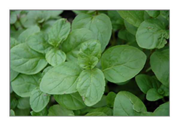
Lemon Bergamot Mint foliage

A beautiful mint valued as a culinary herb or a groundcover; lavender flowers rise above in a mid summer show of color; great container plant and it is suggested that planting within a pot in the ground will curtail invasiveness