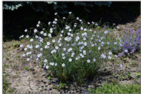
Blue Sapphire Perennial Flax in bloom

Blue Sapphire Perennial Flax is recommended for the following landscape applications;