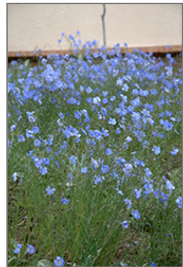
Blue Sapphire Perennial Flax in bloom