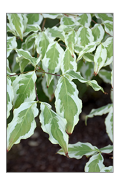
Summer Fun Chinese Dogwood foliage