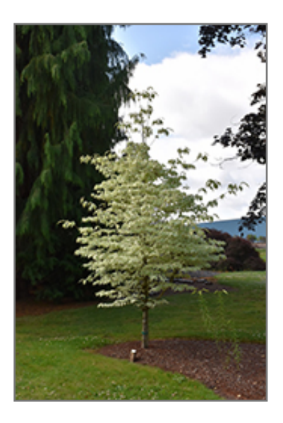
Summer Fun Chinese Dogwood