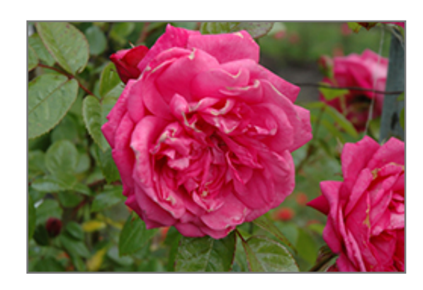
Laguna Rose flowers

An exciting climber that produces spectacular deep pink blooms with a fruit-spice fragrance; excellent disease resistance; perfect for garden walls and trellises; prune this variety after blooming