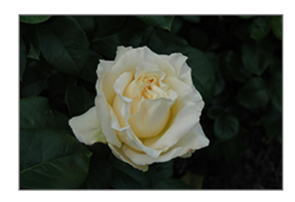
La Perla Eleganza Rose flowers

An outstanding rose presenting large, cupped, pearly-cream blooms that are fully double, with ruffled petal edges; needs full sun and well-drained soil; good disease resistance