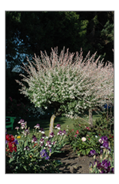
Tricolor Willow (tree form)

Tricolor Willow (tree form) is a fine choice for the yard, but it is also a good selection for planting in outdoor pots and containers. With its upright habit of growth, it is best suited for use as a 'thriller' in the 'spiller-thriller-filler' container combination; plant it near the center of the pot, surrounded by smaller plants and those that spill over the edges. It is even sizeable enough that it can be grown alone in a suitable container. Note that when grown in a container, it may not perform exactly as indicated on the tag - this is to be expected. Also note that when growing plants in outdoor containers and baskets, they may require more frequent waterings than they would in the yard or garden.