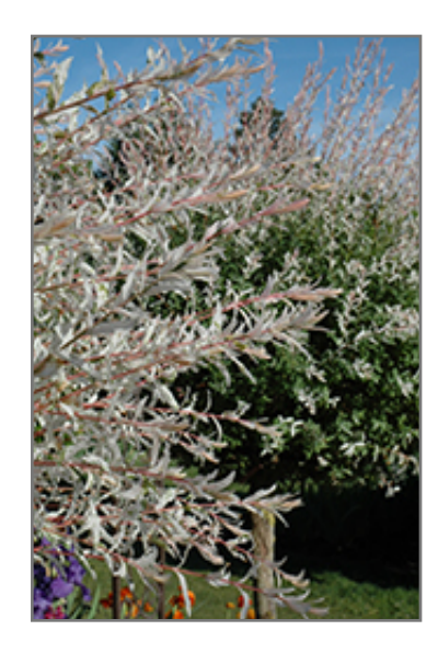
Tricolor Willow (tree form) foliage