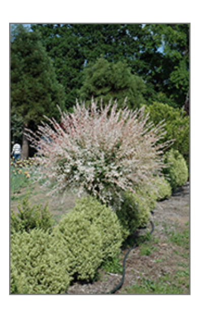
Tricolor Willow (tree form) in spring