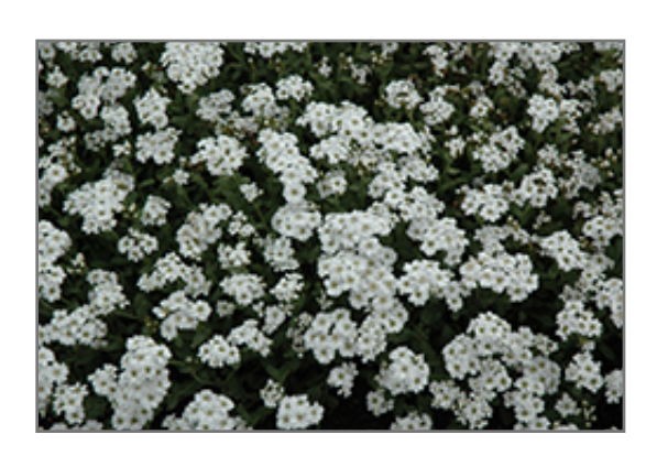
Greek Yarrow flowers

Masses of white blossoms cover a carpet of gray green foliage in summer; low maintenance and easy to grow; a great addition to the garden or containers; evergreen in milder climates