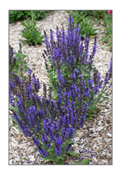
Merleau Blue Sage in bloom