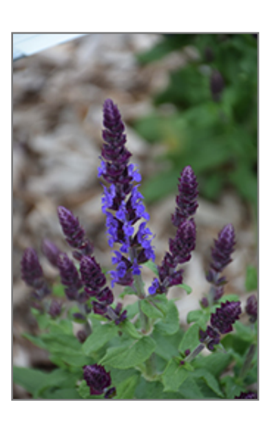
Merleau Blue Sage flowers