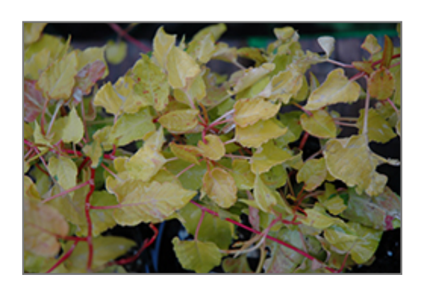
Lemon Lace Silver Lace Vine foliage

A visually pleasing variety with a somewhat restrained growth habit, noted for its lemon-yellow foliage held on red stems; unique, fragrant white flowers create lasting interest with their long blooming season; creates a quick screen on garden structures