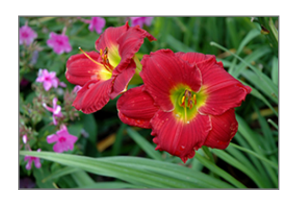
Happy Ever Appster Red Hot Returns Daylily flowers

Pretty, ruffled red trumpets with a golden-yellow throat; provides a bold contrast to other plants; sturdy, strong, easy to care for, great grassy texture and form; a stunning display when massed in the garden