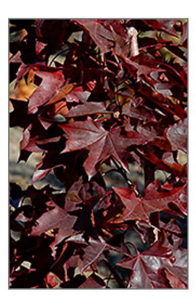
Crimson Sunset Maple foliage