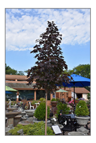
Crimson Sunset Maple