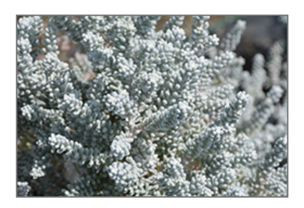
Pearl Bluebush foliage

Pearl Bluebush is recommended for the following landscape applications;