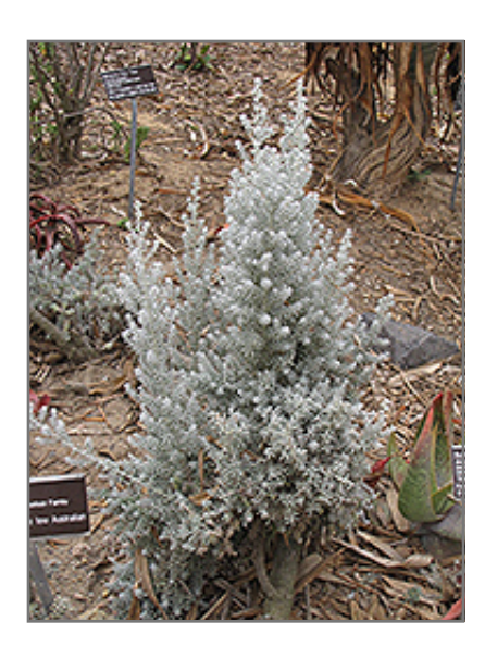
Pearl Bluebush

This is a relatively low maintenance shrub, and can be pruned at anytime. It has no significant negative characteristics.