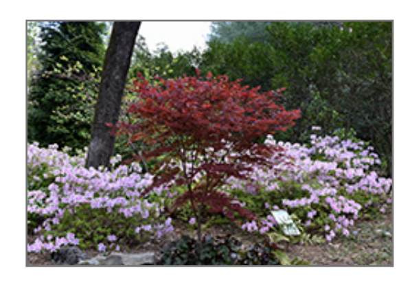
Red Baron Japanese Maple flowers

This is a relatively low maintenance tree, and should only be pruned in summer after the leaves have fully developed, as it may 'bleed' sap if pruned in late winter or early spring. It has no significant negative characteristics.