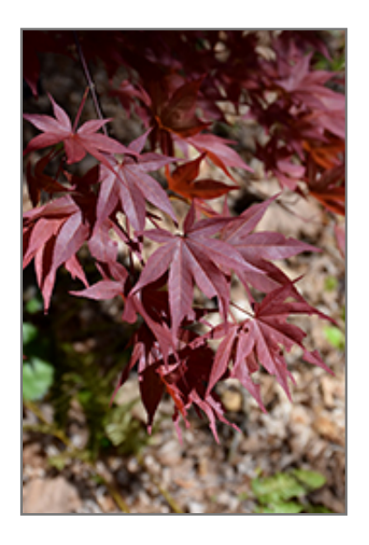
Red Baron Japanese Maple flowers

Red Baron Japanese Maple is recommended for the following landscape applications;