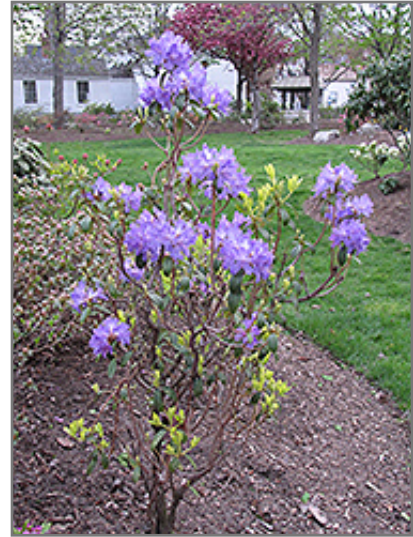
Blue Baron Rhododendron in bloom

This shrub does best in full sun to partial shade. You may want to keep it away from hot, dry locations that receive direct afternoon sun or which get reflected sunlight, such as against the south side of a white wall. It requires an evenly moist well-drained soil for optimal growth, but will die in standing water. It is very fussy about its soil conditions and must have rich, acidic soils to ensure success, and is subject to chlorosis (yellowing) of the foliage in alkaline soils. It is somewhat tolerant of urban pollution, and will benefit from being planted in a relatively sheltered location. Consider applying a thick mulch around the root zone in winter to protect it in exposed locations or colder microclimates. This particular variety is an interspecific hybrid.