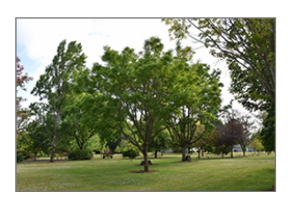
Eye Stopper Cork Tree

A stately variety that tends to grow upright, then spread as it matures; an excellent landscape tree with interesting corky bark; and spectacular, bright yellow fall color; a generally seedless selection