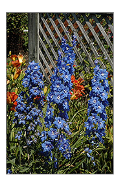
Cobalt Dreams Larkspur flowers

A magnificent display of radiant, cobalt-blue flowers on towering spikes with contrasting white bee; good vertical form, dense flower spikes and strong stems; excellent uniformity is perfect for along borders