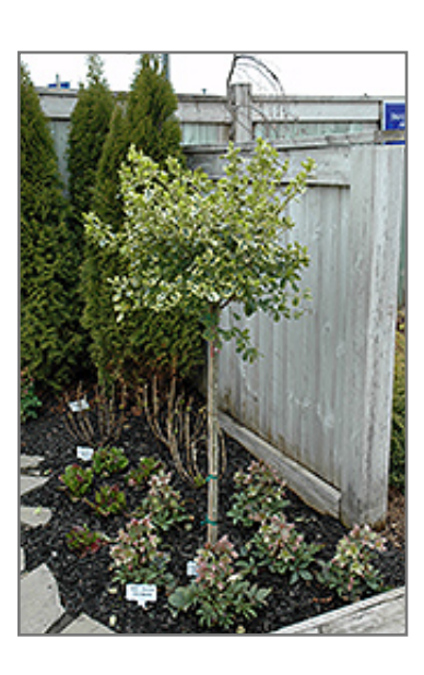
Canadale Gold Wintercreeper (tree form)

Canadale Gold Wintercreeper (tree form) has attractive gold-variegated dark green foliage with hints of creamy white which emerges light green in spring on a tree with a distinctive lollipop-like form. The glossy oval leaves are highly ornamental and remain dark green throughout the winter. It produces pink capsules from mid to late fall.