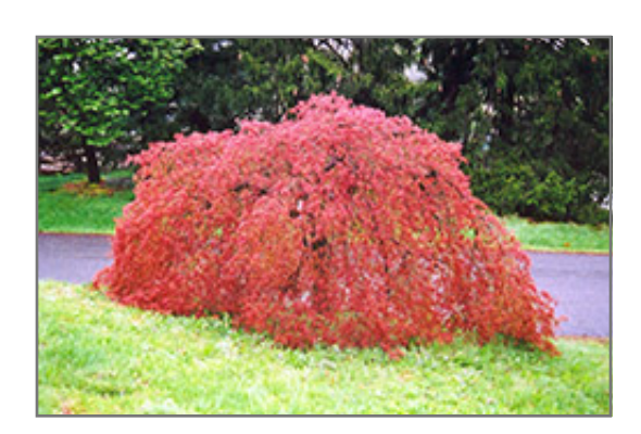
Weeping Japanese Maple

A stunning small accent tree which features finely cut foliage that emerges fiery red, turning deep green and finally hot red again in fall, on a gracefully weeping form; makes a great accent for the mixed garden border