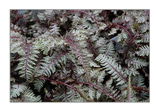
Regal Red Painted Fern foliage

Attractive tri-color fronds of silver, red and pale green; colorful maroon-red central stems and veins; compact and dense, perfect for shady spots; beautiful in masses on the edges of ponds or streams