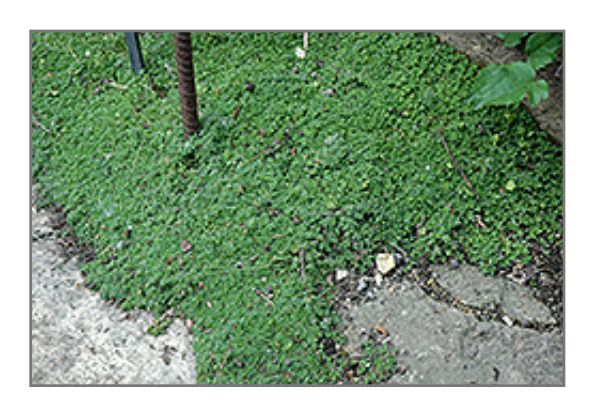
Minor Miniature Thyme

Arguably one of the lowest-growing groundcover perennials available, this tiny spreader literally hugs the ground with its miniscule leaves, lilac-pink flowers appear on short stalks in summer; a very low maintenance plant, excellent for the rock garden