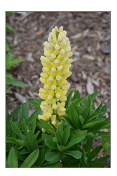
Popsicle Yellow Lupine flowers

A standout dwarf hybrid producing thick spikes of eye catching yellow-cream flowers; a tremendous visual impact when massed in the garden, in border plantings or containers